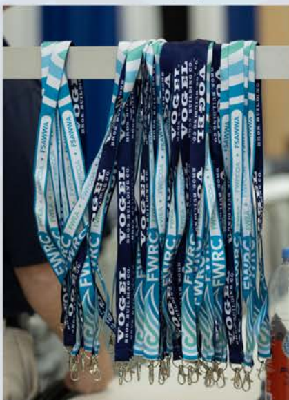
2023 Lanyard Sponsor