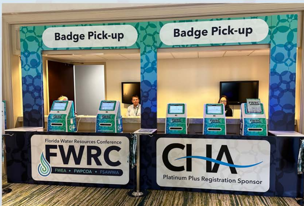
2023 Registration Sponsor