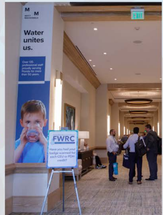
2023 Overall Technical Sponsor