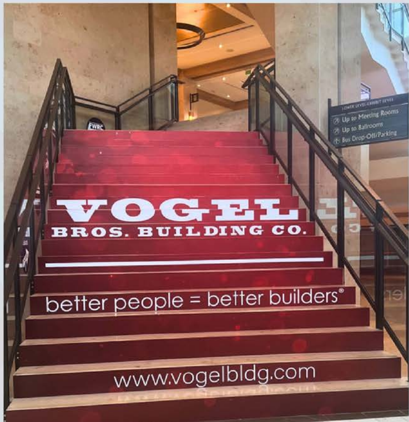
2023 Staircase Sponsor