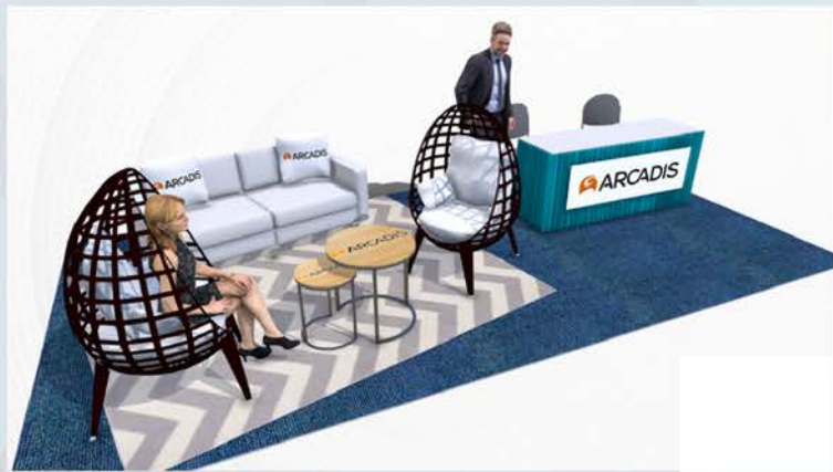
2022 Network Lounge Sponsor

*If Furniture supplied by FWRC, cost estimate approx. $1,500