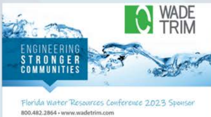
E2023 Room Key Sponsor