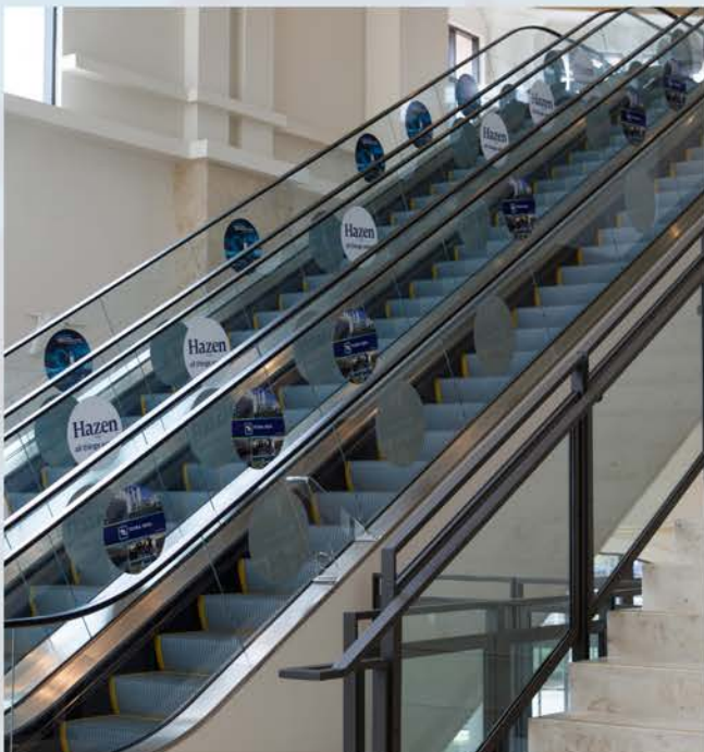
2023 Escalator Sponsor