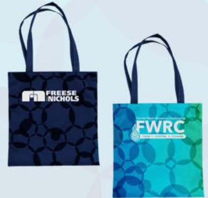
2023 Bag Sponsor