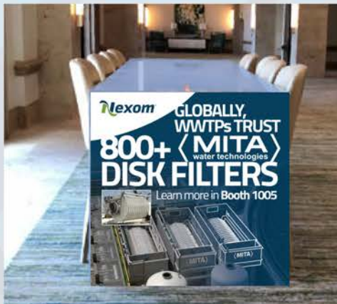
2023 Charging Table Sponsor