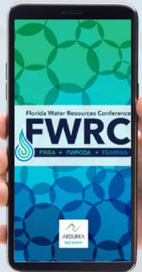
2023 App Sponsor